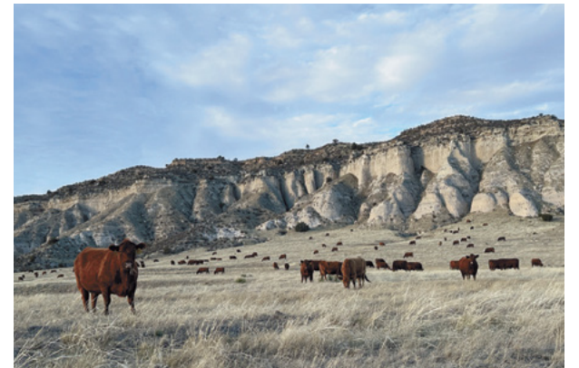
Located in Nebraska's Panhandle is Schuler Red Angus.

Sand County Foundation President and CEO. "Their dedication to conservation is both an inspiration to their peers as well as a reminder to all how important thoughtful agriculture is to clean water, healthy soil, and wildlife habitat."