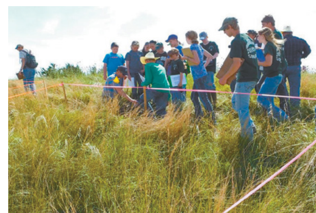
Students must identify plant types, ecological sites and grazing suitability for cattle and wildlife as part of a Rangeland and Soil Days contest.

with results and awards presented after lunch.