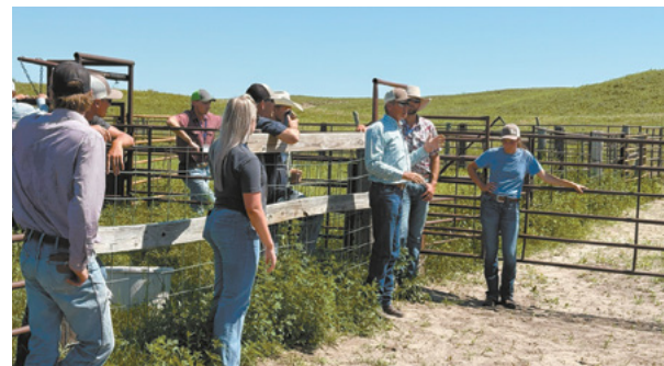
Young Adult Ranching for Profit School will be held Aug. 4-7 in Kimball, Neb. It is for producers ages 18-25.