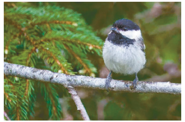
The black-capped chickadee feeds its chicks 350-570 caterpillars every day, which requires suitable habitat.

There are also sections for woodland plants and